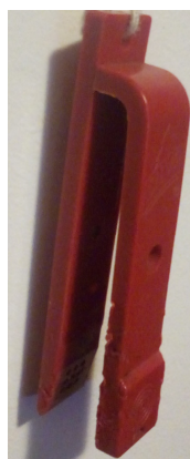
3. Manual Punch

Upon arriving at the checkpoint, all team members must hold the Navlight punch to the reader and will see a red flash to indicated it has recorded your visit. Note that in locations in the sun, the flash may be hard to see so check this carefully. Some of the checkpoints closer to the Hash House will have multiple punches where many teams will be visiting simultaneously to reduce crowding – participants only need to punch one of these. If the Navlight does not flash, this indicates it is malfunctioning, and you must either